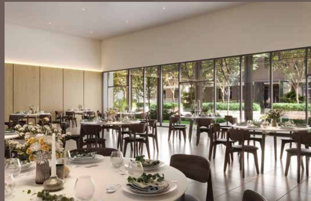
Chic and stylish convenience: space for you to play host 时尚优雅又便利：善尽主人之谊