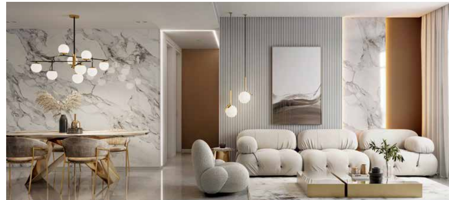
Tranquil spaces for a life of gentle comfort 静谧安宁，享受温柔舒适的生活