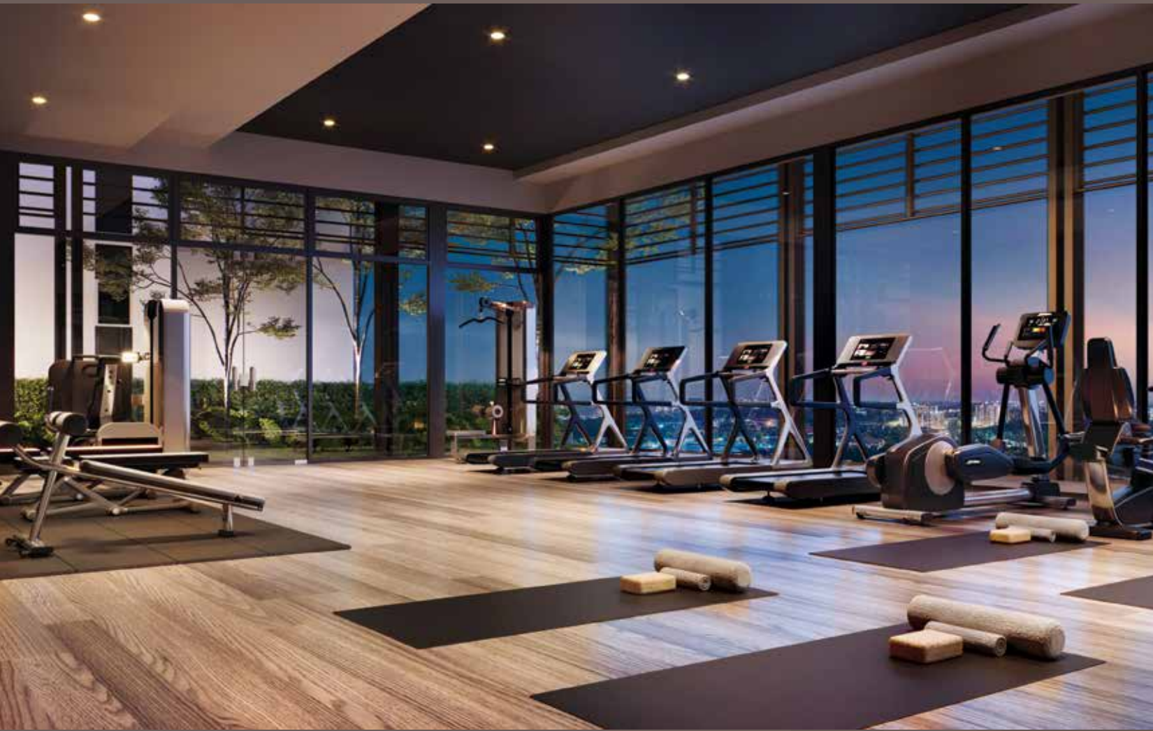
Sculpting bodies, forging minds: where fitness dreams thrive 塑身锻灵：强身健体之地