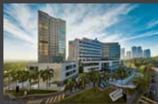
Gleneagles Medini Hospital