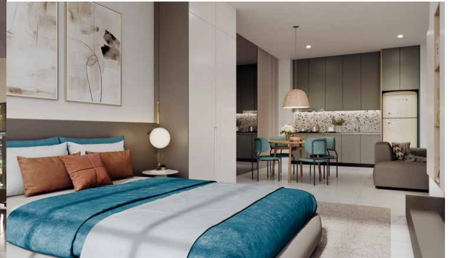
Lavish opulence that defines a life of luxury 豪华生活的奢华定义