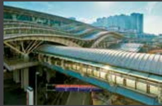
Johor Bahru Sentral