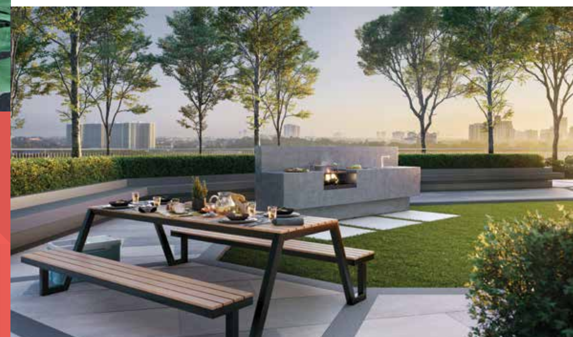
Chill out amidst sizzling savoury aromas 鸟语“绿”香中怡然自得

无论是跃入闪闪发光的泳池中，或是在池边悠闲地躺着，拍摄炫酷的照片。亦或是在户外烧烤和休闲区感受热闹烧烤气氛和轻松悠闲的聚会。还是在沉浸式草坪上与生活良伴闲聊享受户外的宁静。这都是您值得拥有的幸福与美好。