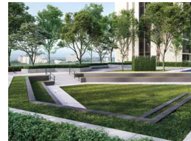
Sunken sanctuary for tranquil gatherings 沉浸式闲憩小聚的圣地

Cannonball into the sparkling waters or lounge poolside for the best Insta-worthy shots. Sizzle, grill and chill with your squad at the outdoor BBQ and hangout area. Outdoor bliss takes centre stage in the sunken lawn, where good company meets great vibes.