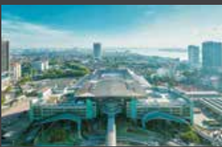
Sultan Iskandar CIQ