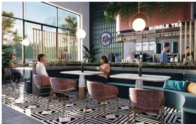
Stylish and spacious interiors with high street-front visibility, ready to attract an urban clientele. 室内宽敞时尚，街景尽收眼底。

Adison零售店是这个社区不可或缺的重点，这里汇聚了各式商店，提供琳琅满目的商品和服务。这种共生关系打造一个繁荣、充满活力和互动的乐活中心，并培养居民的归属感和忠诚度。