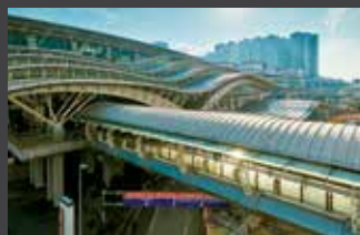
Johor Bahru Sentral