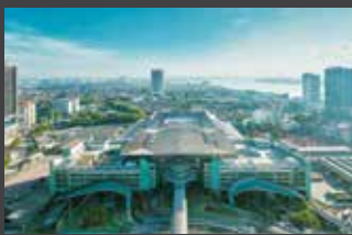
Sultan Iskandar CIQ