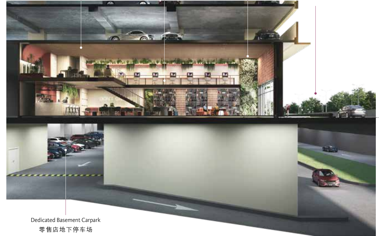
Dedicated Basement Carpark 零售店地下停车场