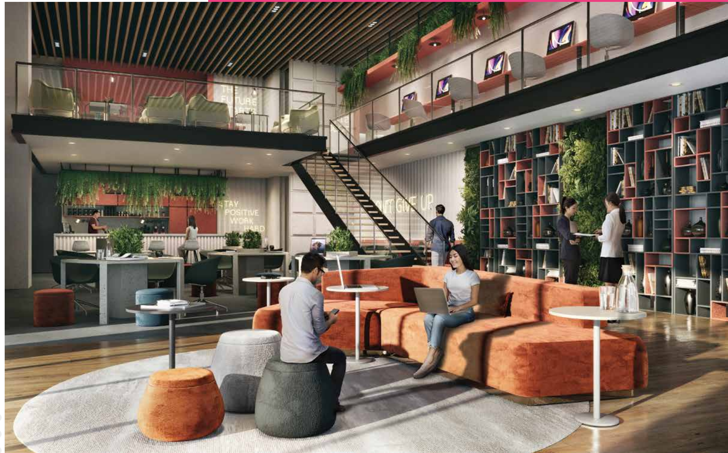
Flexible spaces that suit a variety of businesses. 满足不同事业需求的灵活空间。

随着新山W City Larkinton的总体规划内住宅项目的开发，新的市场也将会被打开，所以现在是您购买和投资的最佳时机。